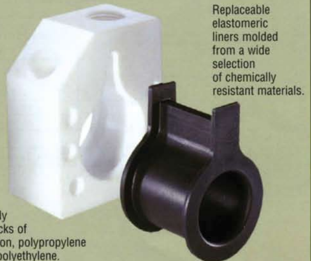
Body blocks of Teflon, polypropylene or polyethylene.

Only these two (2) nonmetallic components contact the fluid being pumped.