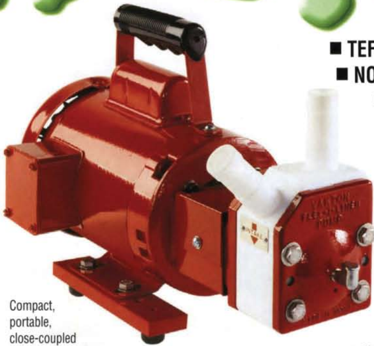
Compact, portable, close-coupled Flex-I-Liner ® pump with totally enclosed electric motor.