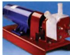
Variable speed drive