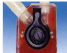
Rotor on eccentric shaft