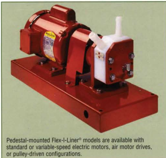
Pedestal-mounted Flex-I-Liner ® models are available with standard or variable-speed electric motors, air motor drives, or pulley-driven configurations.

external leakage. Only two components are in contact with the fluid — the inner surface of the plastic pump body and the outer surface of the rugged replaceable elastomeric flexible liner. This easy-to-service construction keeps maintenance and downtime to a minimum. More than 175,000 of these dependable sealless, self-priming pumps are in service handling aggressive and other problem fluids.