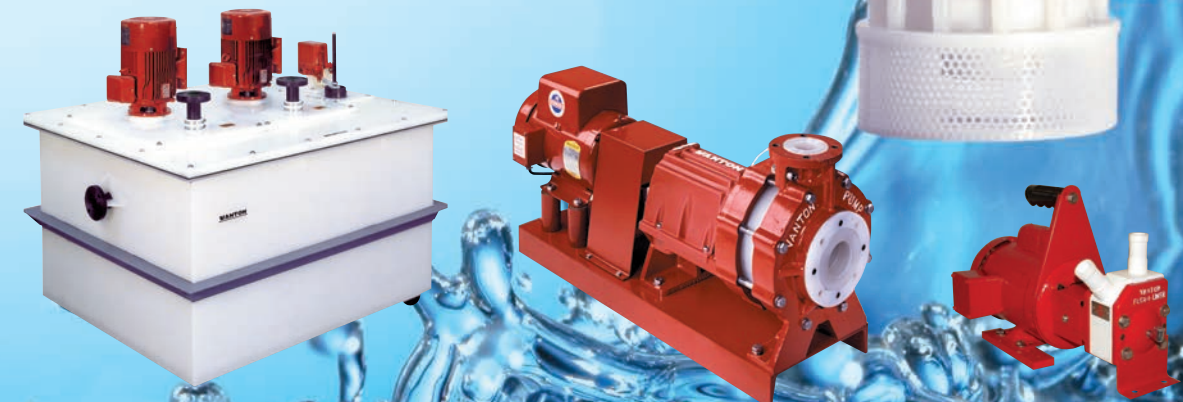
Pump/Tank Non-metallic Systems