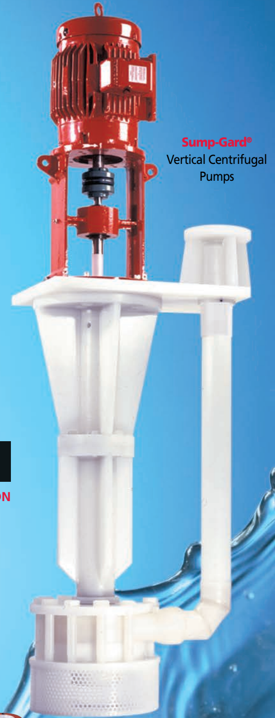
Sump-Gard® Vertical Centrifugal Pumps

Be sure to visit our display at WEFTEC 2014 in Booth 2645