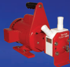
Flex-I-Liner® Rotary Peristaltic Pumps