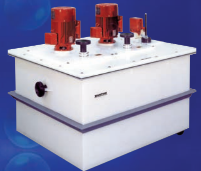
Pump/Tank Non-metallic Systems