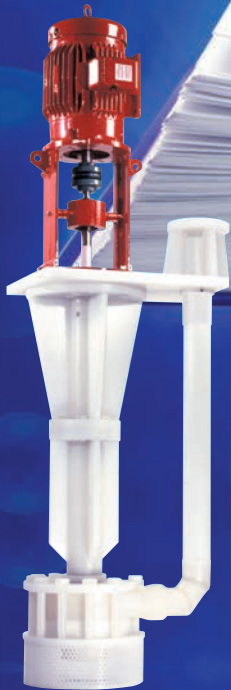
Sump-Gard® Vertical Centrifugal Pumps