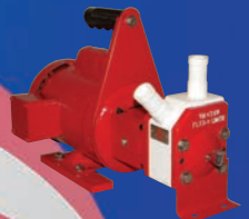
Sump-Gard® Vertical Centrifugal Pumps